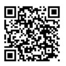
Ways to Give

WEBSITE: www.LaramieSoupKitchen.org • EMAIL: Director@LaramieSoupKitchen.org